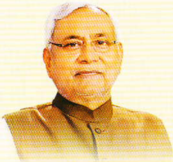
Mr. Nitish Kumar Chief Minister, Bihar, India

Excellencies, Distinguished leaders, Ladies and Gentlemen,