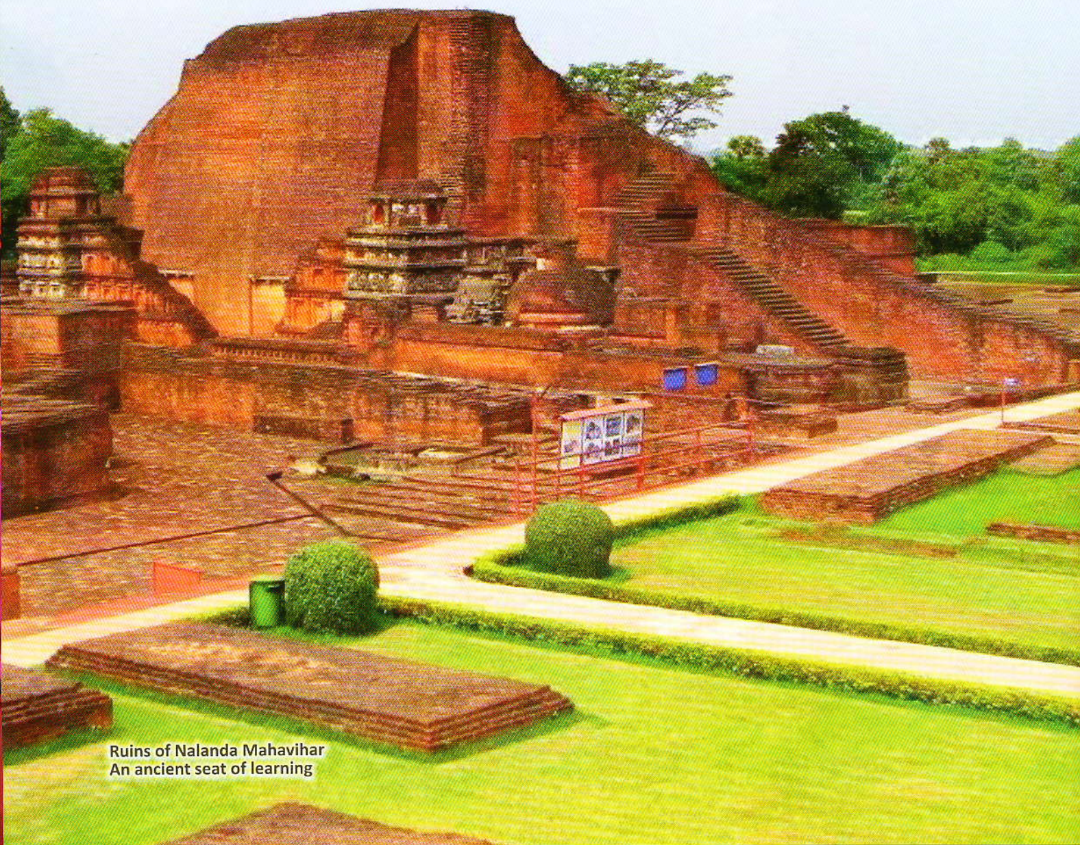
Ruins of Nalanda Mahavihar An ancient seat of learning

Another wonderful example of Indo Japanese's collaboration is Bihar Museum. Getting selected through an international bid, the famous Japanese architectural firm 'Maki & Associates' has envisaged the architectural design of